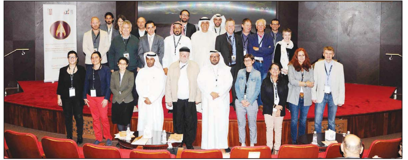
Participants of the Third Neolithic Conference of the Arabian Peninsula.

He expressed hope the conference would create an archaeological climate, and take a step toward expanding knowledge and reveal historic facts.